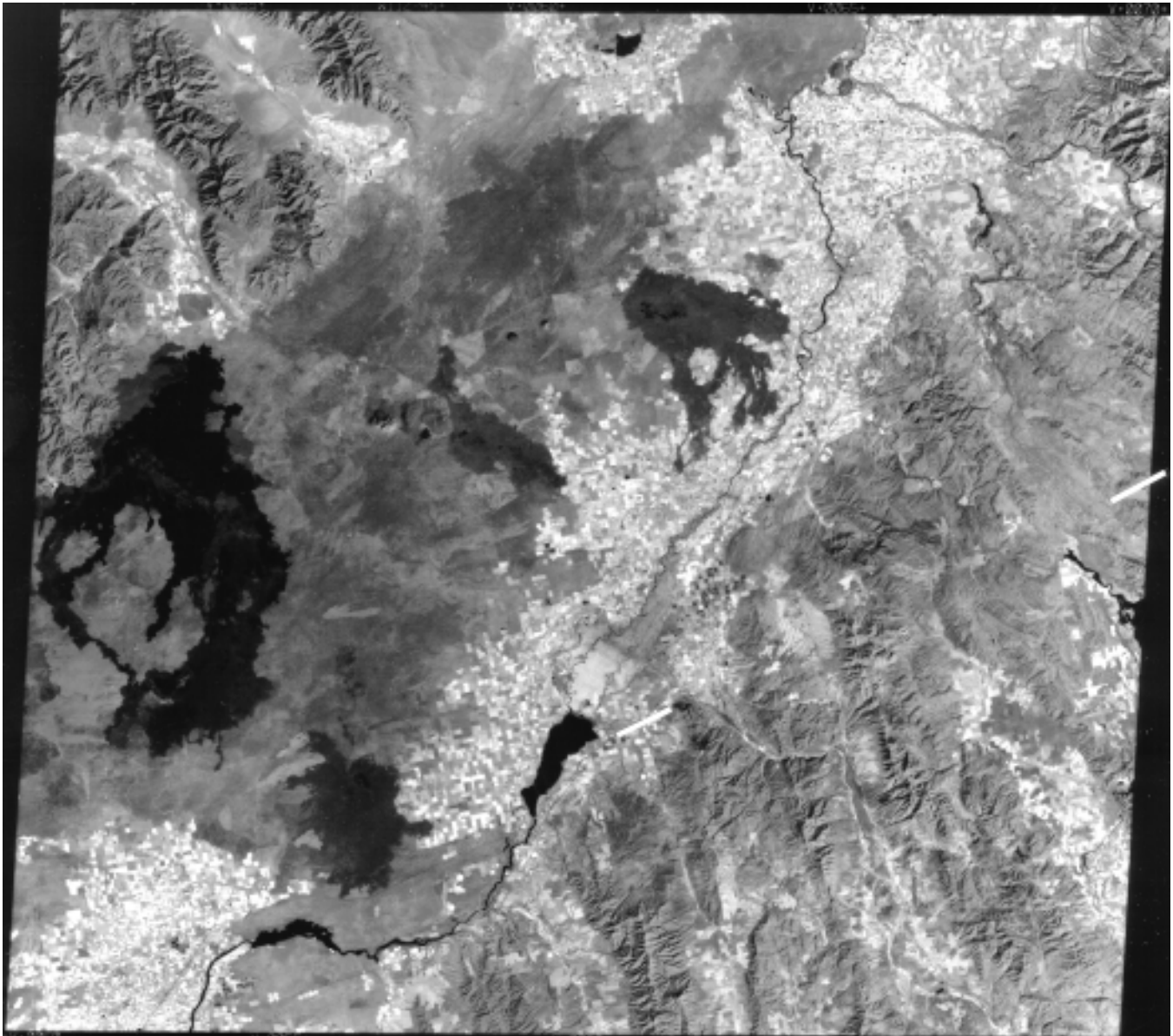
Figure 3. Black-and-white Landsat image of the western end of the southeast Idaho lineament, showing its apparent “truncation” by the eastern Snake River Plain immediately southwest of Pocatello, Idaho. American Falls Reservoir, just west of Pocatello, is clearly visible in the lower-center portion of the image. Thin white lines lie parallel to the trend of the lineament.

tions (Albee et al., 1977). The Camp Davis Formation is locally folded on the opposite (east) side of the Snake River. At Hoback Junction, we bear right and continue west on Highway 26 to Alpine. Immediately north of Astoria Hot Springs the Darby thrust fault places Permo-Pennsylvanian strata (Phosphoria and Wells Formations, respectively) over steeply dipping Jurassic and lower Cretaceous strata. Between Astoria Hot Springs and Alpine, Highway 26 winds through the Grand Canyon of the Snake River, traversing the Darby thrust sheet and the eastern portion of the Absaroka thrust sheet. Notable structural features include the Little Greys River anticline in the Darby thrust sheet, the St. Johns imbricate fan (duplicating Cambro-Ordovician strata) in the Absaroka thrust sheet, and the Grand Valley listric normal fault as the canyon opens out into the Grand Valley immediately east of Alpine. Also, the Grand Canyon of the Snake River marks the eastern end of the southeast Idaho lineament (Lageson, 1998).