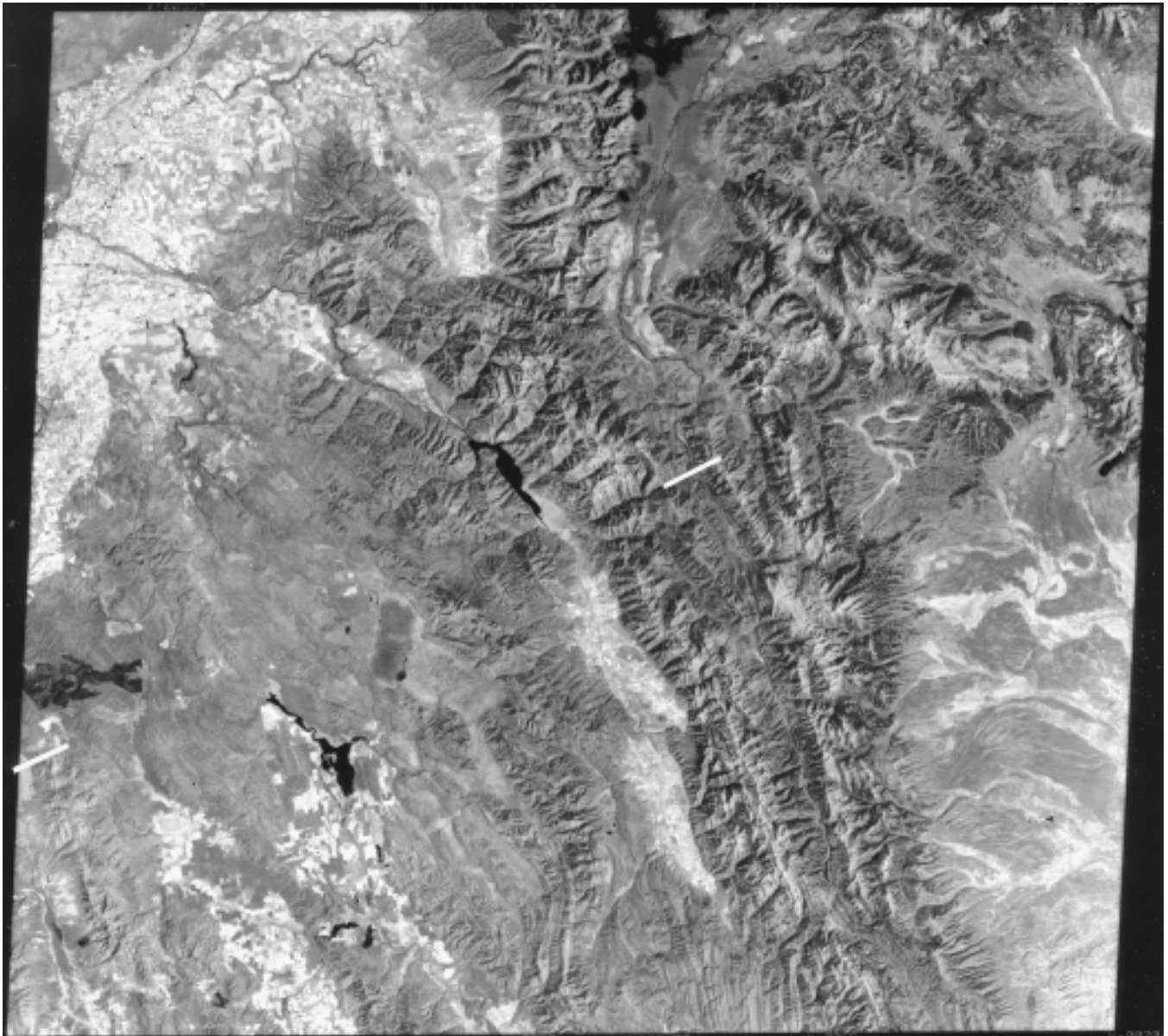
Figure 2. Black-and-white Landsat image of the eastern end of the southeast Idaho lineament, crossing the Idaho-Wyoming fold-and-thrust belt (Sevier orogenic belt). Palisades Reservoir is visible just left-of-center. Thin white lines lie parallel to the trend of the lineament.

Resume field trip. Return to Jackson via Highway 191.